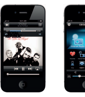
Denon Remote App