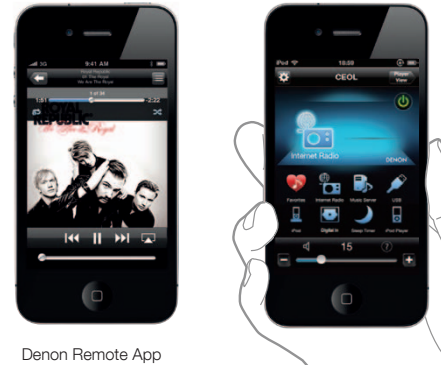
Denon Remote App