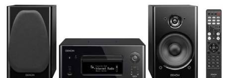
*Black version is also available